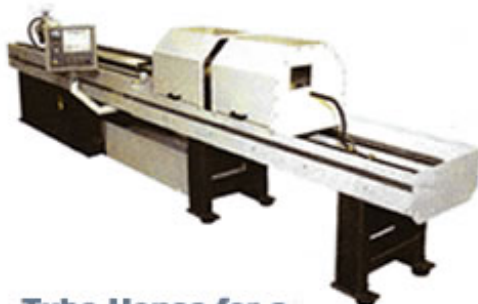
Tube Hones for a wide range of big work

3D Honing believes in customer service and quality control. We like to discuss the job with our clients providing advice and suggestions on the best and quickest way to achieve the highest quality result.